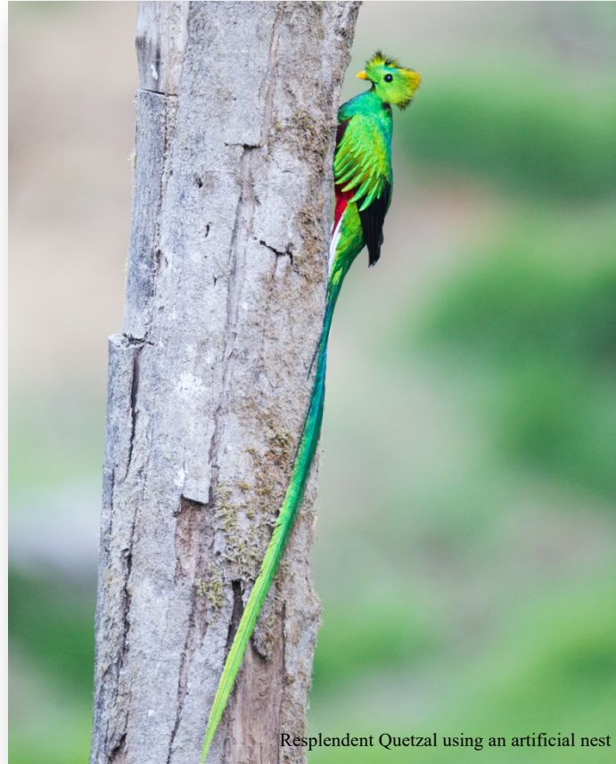
Resplendent Quetzal using an artificial nest